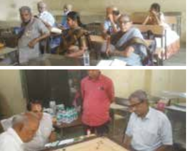
PROBUZZ ... OCTOBER 2022 PAGE 6