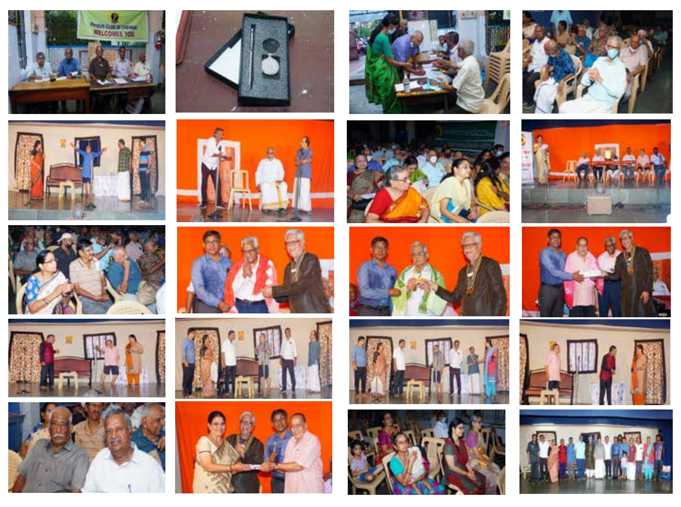
PROBUZZ... OCTOBER 2022 PAGE 7